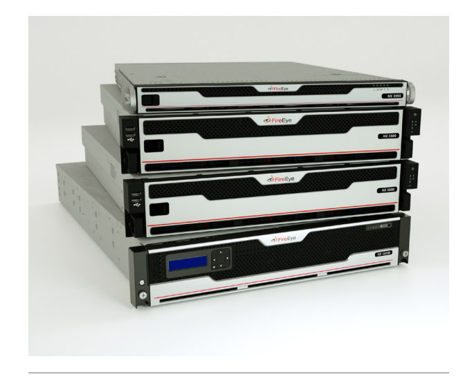
Figure 2. Examples of Integrated Network Security include NX 2550, NX 3500, NX 5500, NX 10550.