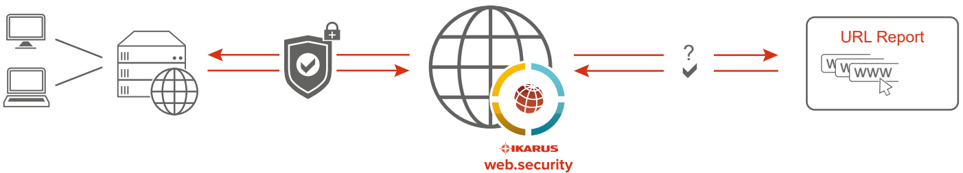
Fig. 1 - Central security proxy with reliable malware detection, flexible filter options and global URL category lists.

Thanks to its multi-client capability and manageable user management, IKARUS web.security is not only ideal for classic application in companies. Large enterprises as well as internet service providers benefit from the option of offering the service under their own brand and using their own design. Use landing- and block response pages for your messages and purposes – for example for registration in your network, to communicate terms of use or for targeted advertising messages. All other instances can be configured independently and offer your clients just as much scope.