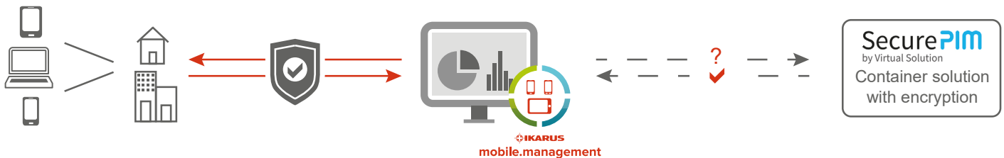
Figure 1 - Central mobile management system for secure and controlled use of mobile devices in corporate environments

Mobile solutions will also play a key role in future in our private and working life. It is therefore appropriate to invest in a future-proof solution: Professional concepts, simple to operate and reliable methods are worthwhile. Those who neglect their data protection obligations must expect to pay high penalties.