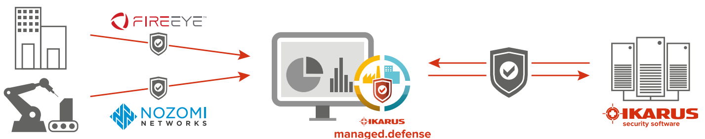
Figure 1 - IKARUS managed.defense provides security, visibility and predictive maintenance for your IT, IoT and OT environments. The service integrates seamlessly into your existing systems.

Working together with the strongest partners in their area, IKARUS operates as an exclusive technology provider in Austria, offering the currently most comprehensive and most precise service for cyber security and incident response for your entire IT, IoT and OT environment. Thanks to a transparent and modular structure, all structures can be securely merged in a central platform and controlled from there. As a hybrid, the solutions merge local installations where they make sense and are necessary, with the possibility of either operating some of the services on site or obtaining them from the cloud.