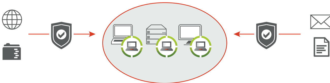
Fig. 1 - IKARUS anti.virus protects laptops, desktops and servers from harmful programs and unwanted intruders.

The integrated antispam function scans incoming and outgoing emails in Microsoft Outlook for spam and infections. If an email is found to be infected, the attachment will be deleted. spam can be marked or moved, and you can set up individual black- or whitelists based on sender, recipient, content or subject. Equally flexible on-demand scanning forms the perfect complement to the IKARUS anti.virus package. This is a secured quarantine system for malware discoveries, with the option of sending suspicious files directly to the IKARUS lab in Vienna for analysis.